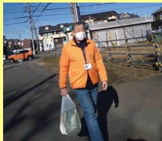
Taking out the garbage

The center started in 2010 to help people in the community with daily needs.