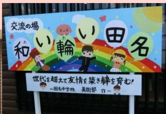
Board created by the art club of Sagami Tana High School students

The place was established on August 2021 as the place where local people can freely come and chat with the neighbors.