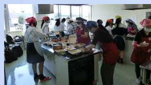
Sagamitana High School students preparing the food for the cafeteria