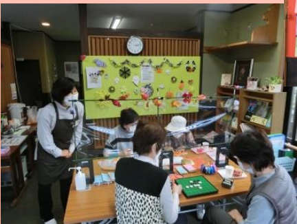
Guests can enjoy playing Japanese chess, shogi or go and making origami