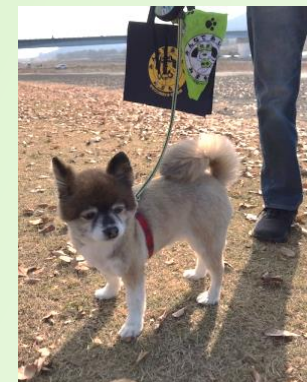
“Mame” is patrolling the riverside near the Takatabashi Bridge of the Sagami River