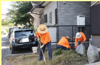
Cleaning the garden