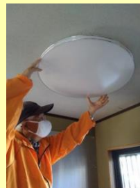
Changing the light bulb