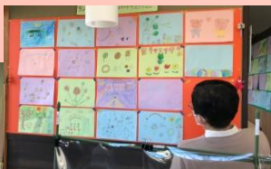
Place mats made by Tana Elementary School students