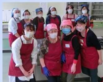
The staff and volunteers in the cafeteria