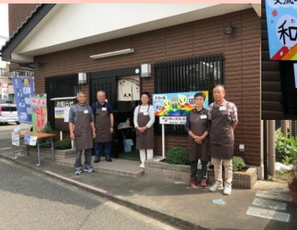
Staff members of the house